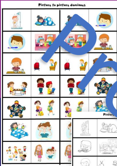
Picture to picture dominoes