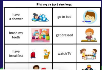
Picture to text dominoes